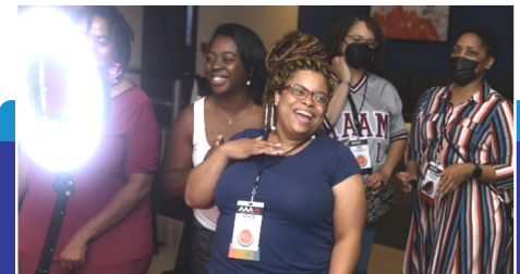
Photobooth Sponsor $2,000