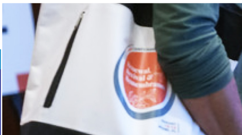
Conference Bag Sponsor $15,000