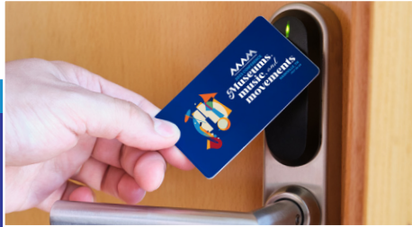
Hotel Keycard Sponsor $7,500

Only 1 sponsorship of each item is available unless otherwise indicated.