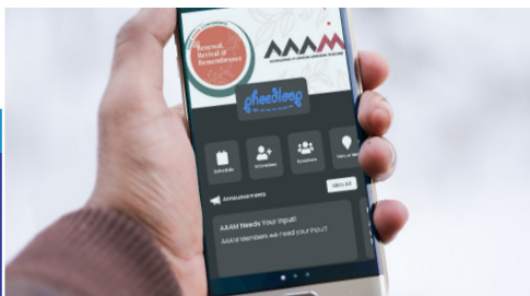
Conference App Sponsor $7,500