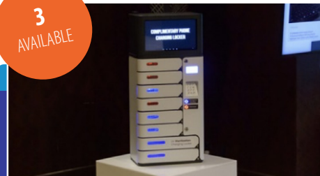
Charging Station Sponsor $2,500