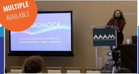
Individual Session Sponsor $2,500