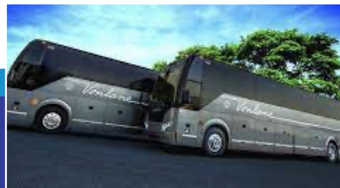
Transportation Sponsor $10,000