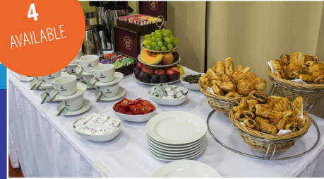
Refreshment/Break Sponsor $5,000