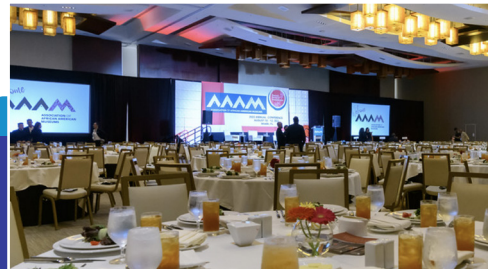
Conference Audio/Visual Sponsor $25,000