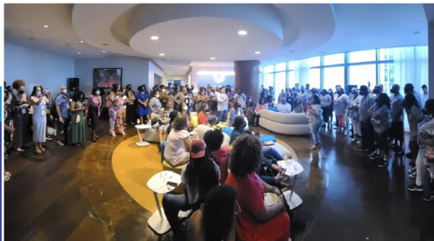
Welcome Reception Sponsor $35,000

Only 1 sponsorship of each item is available unless otherwise indicated.