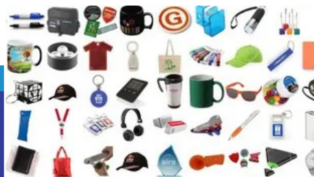
Conference Bag Content Sponsor $500 per placement

Sponsor is responsible for procurement of the placement item as well as delivery to Grand Hyatt Nashville. All items must be approved by AAAM in advance.